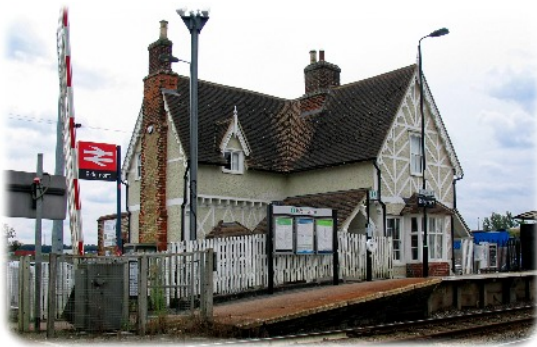
Ridgmont Station, Heritage Centre & Cafe

Refreshments and toilets at Ridgmont Station and Heritage Centre, Woburn Safari Park Entrance, Ridgmont village.